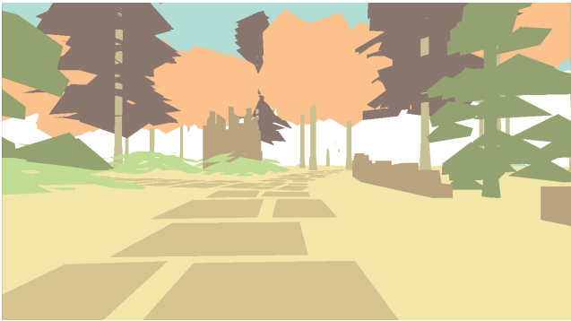
Figure 2: A screenshot from Weird Forest , a game in our inspiring set for ANGELINA 6 , designed by KO-OP MODE as a tutorial for game development.

phasis on the layout and design of the world space to guide the player’s movement and experience.